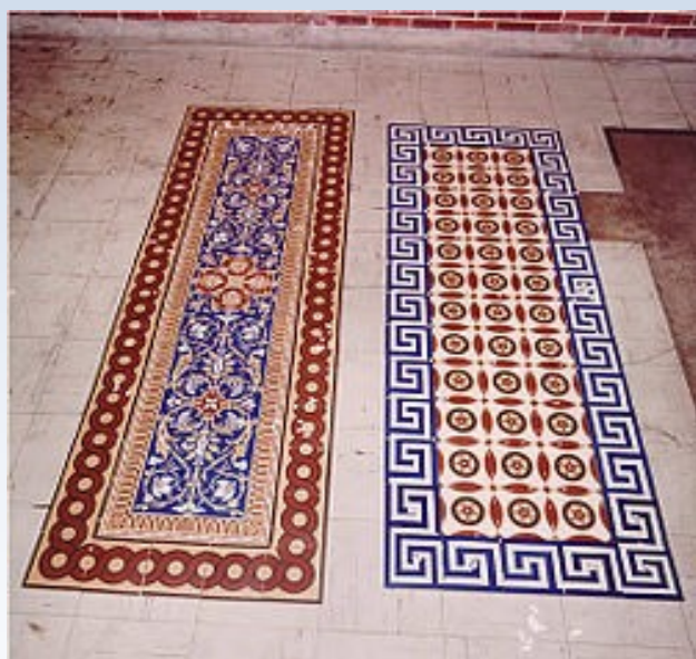
Encaustic clay tiles produced by the Maws Company in the 1800s. The coloured clay goes right through the tile so it stays the same as it wears down from use.

See article inside on former Kenley residents.