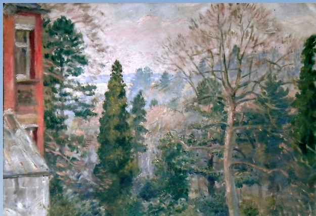
A view from the 'Beeches' in Welcomes Road painted by Daisy Knupper. The house was demolished in the 1970s not long after this picture was painted. See article inside.